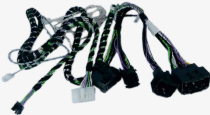
Base Audio: Connect Plug A to B